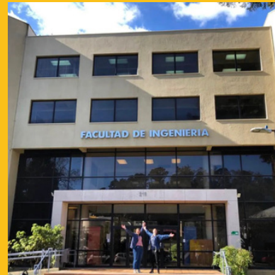
Level 4 Students in Chile