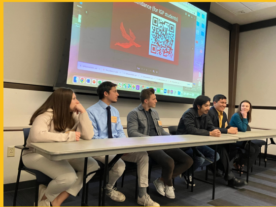
Summit Level 5 SPA Presenters