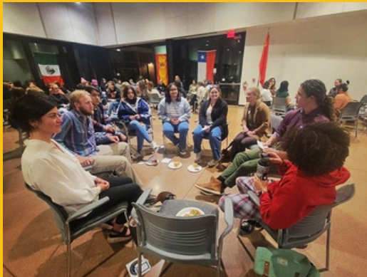
A Successful Welcome Party!