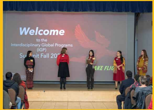
Summit Welcome by IGP Staff