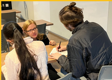
Level 2 English Portfolio with Career Development