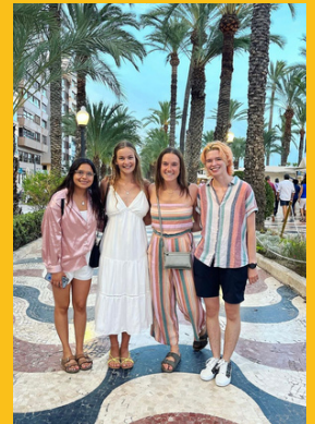
Level 4 Students in Alicante, Spain