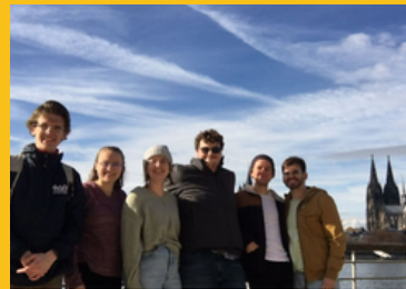
Level 4 Students in Germany