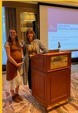
IGP Staff Presenting at NAFSA Region II Conference