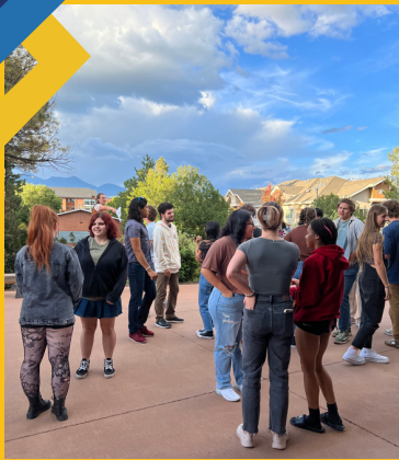
Level 1 Orientation