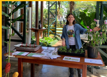
Student internship in Costa Rica