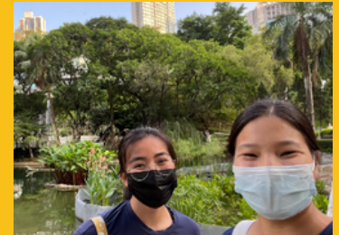
Level 4 Students in Hong Kong