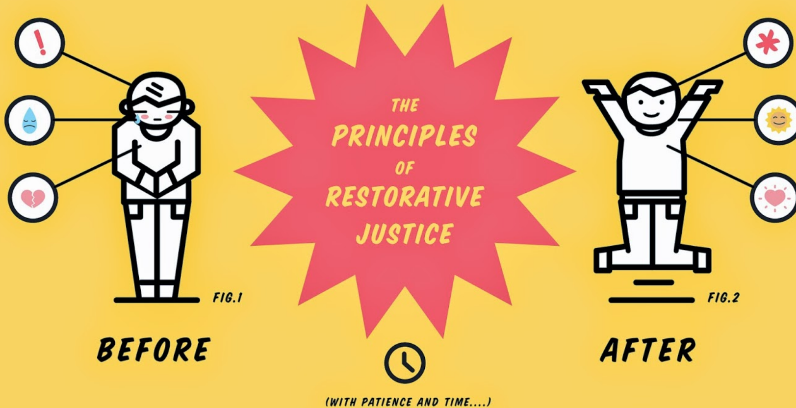
FIG. 1 THE PERSON AFFECTED, BOTH VICTIM AND OFFENDER, REQUIRES SOLUTIONS TO REPAIR THE HARM DONE AND ADDRESS THE DAMAGE. FIG. 2 AFTER FOLLOWING THE PRINCIPLES OF RESTORATIVE JUSTICE, ACKNOWLEDGMENT , POSITIVITY AND SAFETY ARE RESTORED.