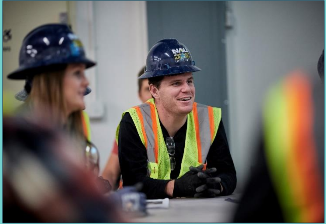
Thankyou McCarthy Construction, Wilson Electric Services Corp., Core Construction and Loven Contracting for directly supporting the C4P+ Lab with your generous donations!