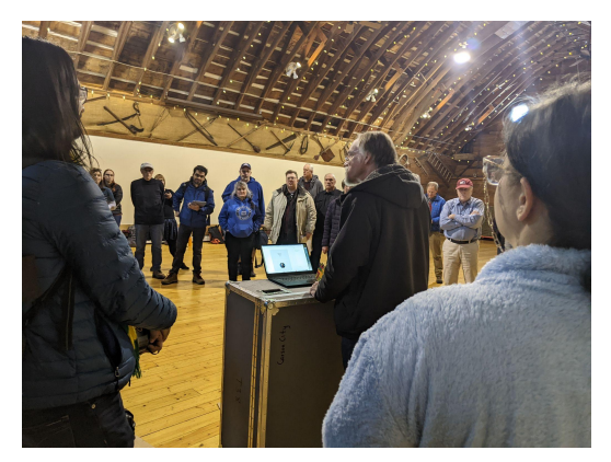
1: Introductions at the day 1 all-hands meeting.

Moons and other companion objects are a powerful tool for studying the physical properties of solar system objects. The motion of a moon as it orbits the main body can inform us about the mass, density, and composition of both objects, something which is very difficult to do without a ground-truth measurement. But the orbit of Polymele's moon is not well known: The discovery only comprises a single detection, with which it is difficult to precisely determine the orbital geometry of the system. This was the purpose of this recent occultation