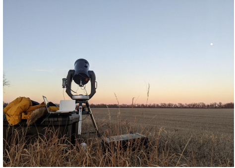
4: Sunset on event night.

Because of the uncertainty in the position of the moon, an unprecedented effort was required: 200 professional and citizen scientist observers were recruited from across the country to deploy 100 telescopes across rural Kansas, collecting more than 3 terabytes of data in a search for the moon. This was a triumph in citizen scientist engagement, as more than half of our observers were non-professionals, and many had no prior experience operating telescopes. This event was also a very powerful avenue for community engagement. While I was observing along the side of a deserted dirt road in the middle of Nowhere, KS, I was approached by a farmer and his daughter