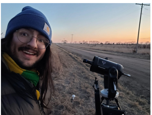
3: Excited for the big night!

Polymele's moon was discovered during an event known as a stellar occultation, during which an asteroid or comet passes in front of a distant star, blocking out its light and casting a shadow on the surface of the Earth. This technique can be used to measure the precise shape and size of the asteroid, because the shadow cast produces an exact image of the object itself. During a