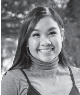
Maia Ganan Interior Design