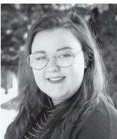
Clay Woodard Theatre