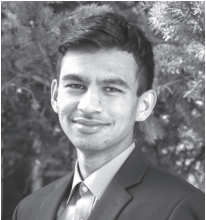
Aarish Raza Nursing College of Health and Human Services