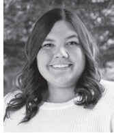
Sydney Drop Forestry