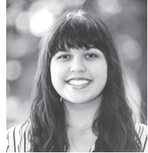
Yazhmin Dozal Environmental Sciences College of the Environment, Forestry, and Natural Sciences