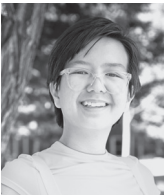
Volpe Vo Environmental Engineering