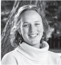
Ava Miller College of Education